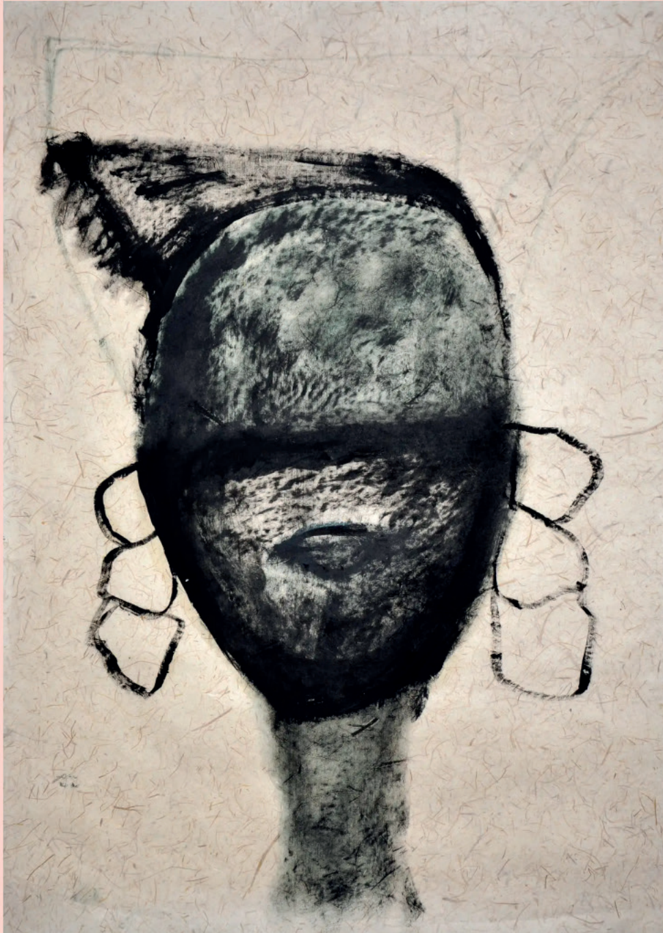
Untitled self portrait